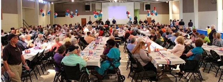
Hundreds of supporters pack the Lake Mirror Center for the event put on by the Lakeland Police Department's Citizens Academy Alumni Association (LCPAAA). — at Lake Mirror Center.