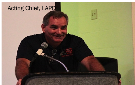
Acting Chief, LAPD