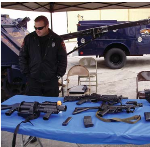
SWAT Team Display