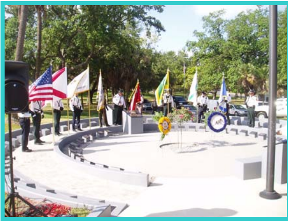
Presentation of Colors by Joint Color Guard