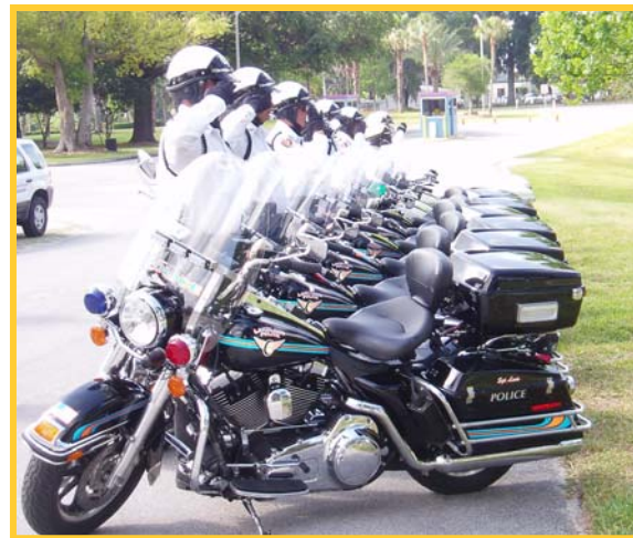
Salute by the Joint Motorcycle Units