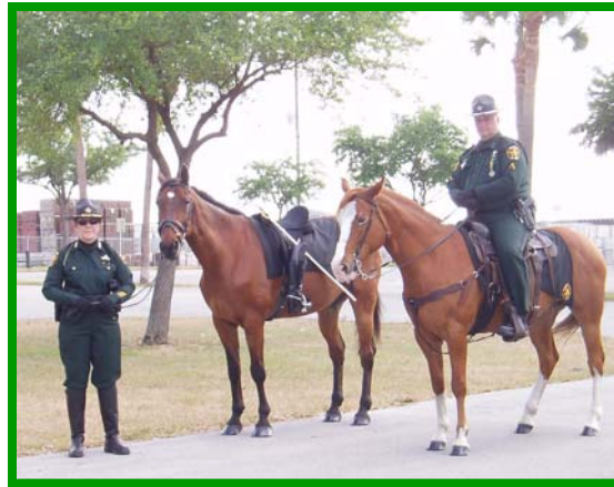
Salute to the Fallen Rider by Polk County Sheriff's Mounted Unit.