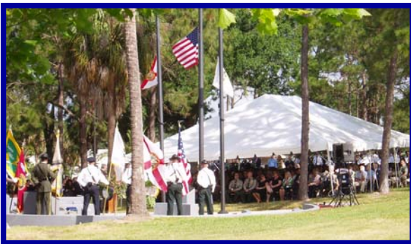
Families, friends, fellow officers and citizens who gathered to pay their tributes during the Memorial Service.