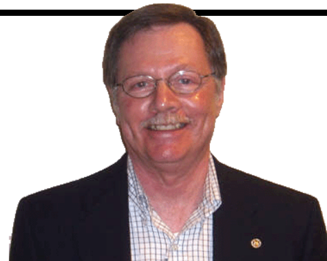
LCPAAA Bylaw Committee Chairperson